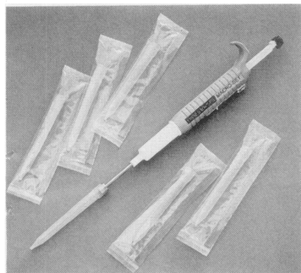
Fig. 1. Disposable plastic tips for liquid transfer are available from Oxford Laboratories. They are shown here with the Macro-Set pipetting device. The tips are sterilized with gamma radiation and color coded by capacity.

The Thomas-Cobb slide mount enables the user to view a specimen from either side under oil immersion. The system consists of two cover glasses (with the specimen between them) held in a soft aluminum frame that has an 18-millimeter hole in the center. The