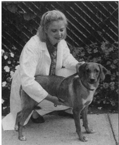
29 & 117 Experimental gene therapy for hemophilia B