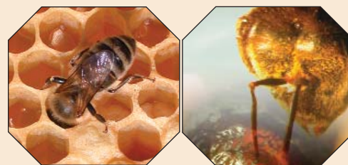
Worker tends egg.

Proc. Natl. Acad. Sci. U.S.A. 101, 8649 (2004).