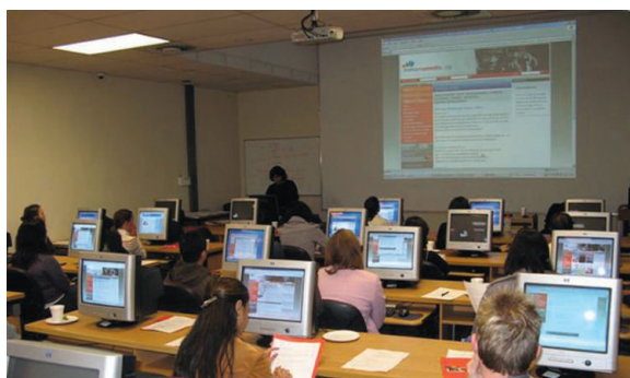
Workshop participants evaluate case study material. Participants of workshops come from tertiary teaching hospitals within South Africa and include interns specializing in pediatrics, pathology, and internal medicine.

The third key component, Treatment and Diagnostics, covers information related to TB and antiretroviral (ARV) drugs, modes of drug action, the HIV life cycle, and specific guidelines for treatment. The “Diagnostic Tools” section provides laboratory assay informa-