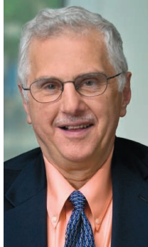
Bruce Alberts is Editor-in-Chief of Science .