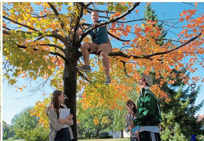
Inquiry investigation. Students worked with collaborative teams to develop innovative methods for quantifying leaf color change and abscission in campus trees. Most groups combined both new technology and lower-tech approaches in their data collection strategy.

expertise. As the real face of the lab, TAs bear immediate responsibility for motivating student learning and bringing new instructional strategies into the classroom. They recognized that the labs we had been teaching, in which students followed protocols to confirm known outcomes, did not reflect the biology that motivated each of us to become biologists. We believed that in order to change both the content and culture of our labs, we would need to fully engage TAs as collaborators in the reform process.