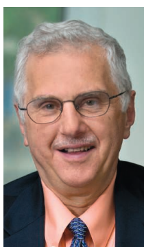
Bruce Alberts is Editor-in-Chief of Science .