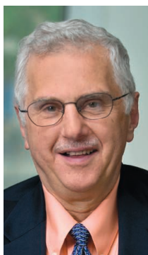
Bruce Alberts is Editor-in-Chief of Science .