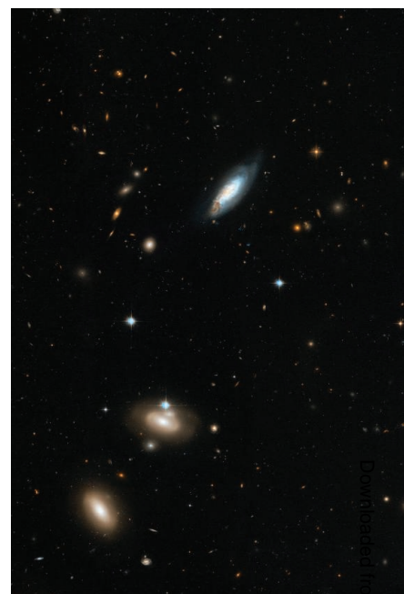
pages 40 &amp; 53