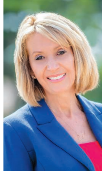
Marcia McNutt is Editor-in-Chief of Science .