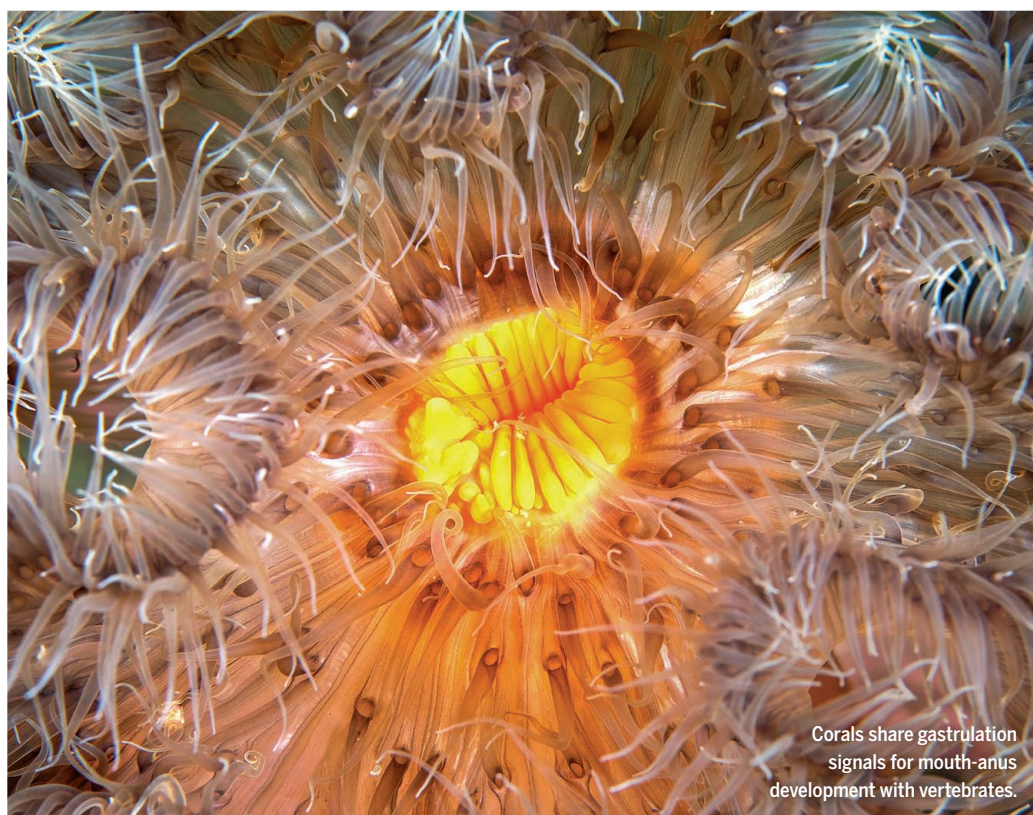
Corals share gastrulation signals for mouth-anus development with vertebrates.