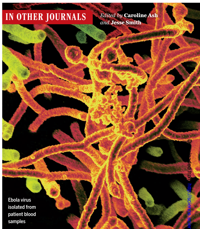
Ebola virus isolated from patient blood samples