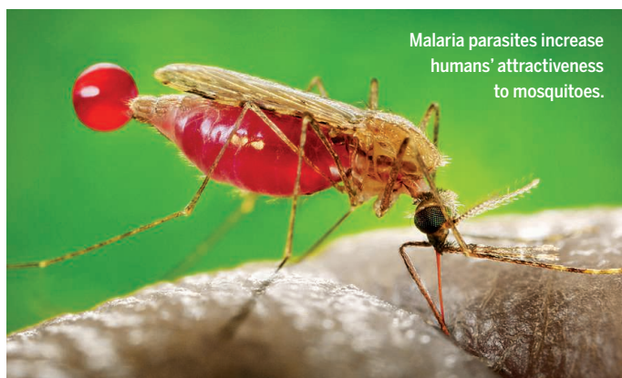
Malaria parasites increase humans' attractiveness to mosquitoes.