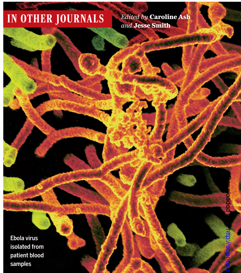
Ebola virus isolated from patient blood samples