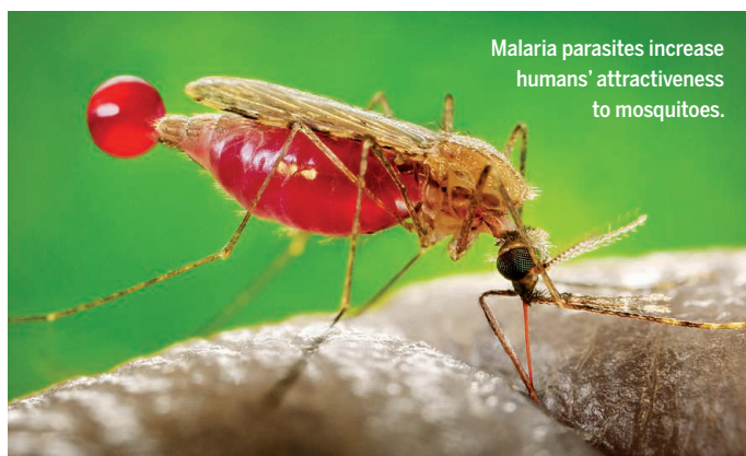
Malaria parasites increase humans' attractiveness to mosquitoes.