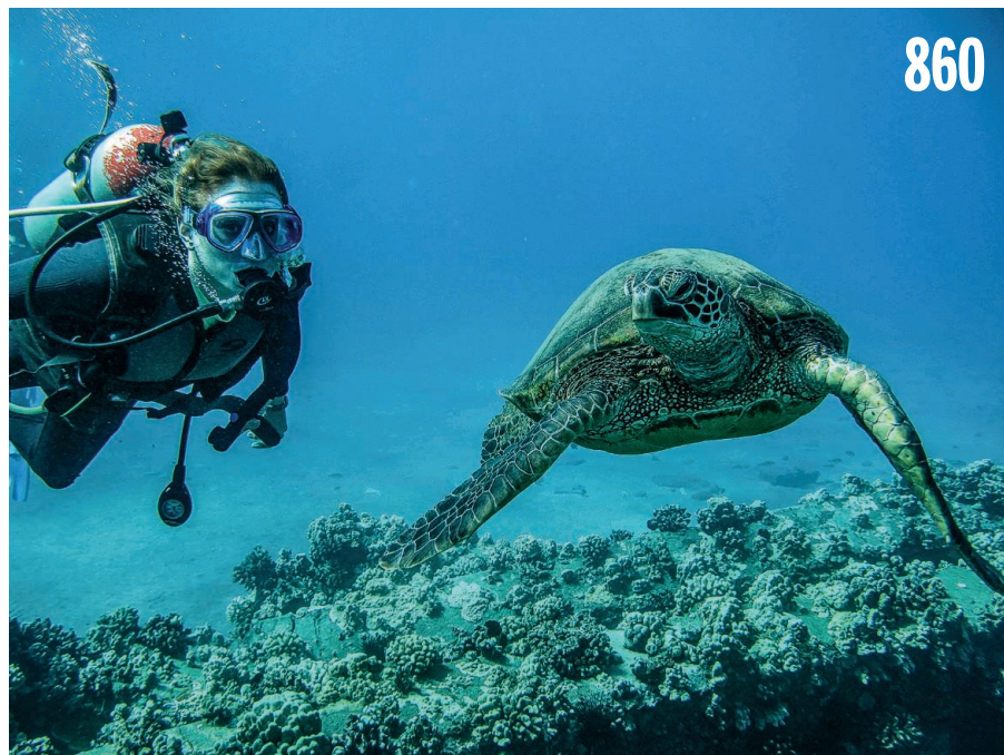
Scientists dive into politics