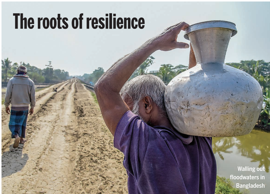
Walling out floodwaters in Bangladesh