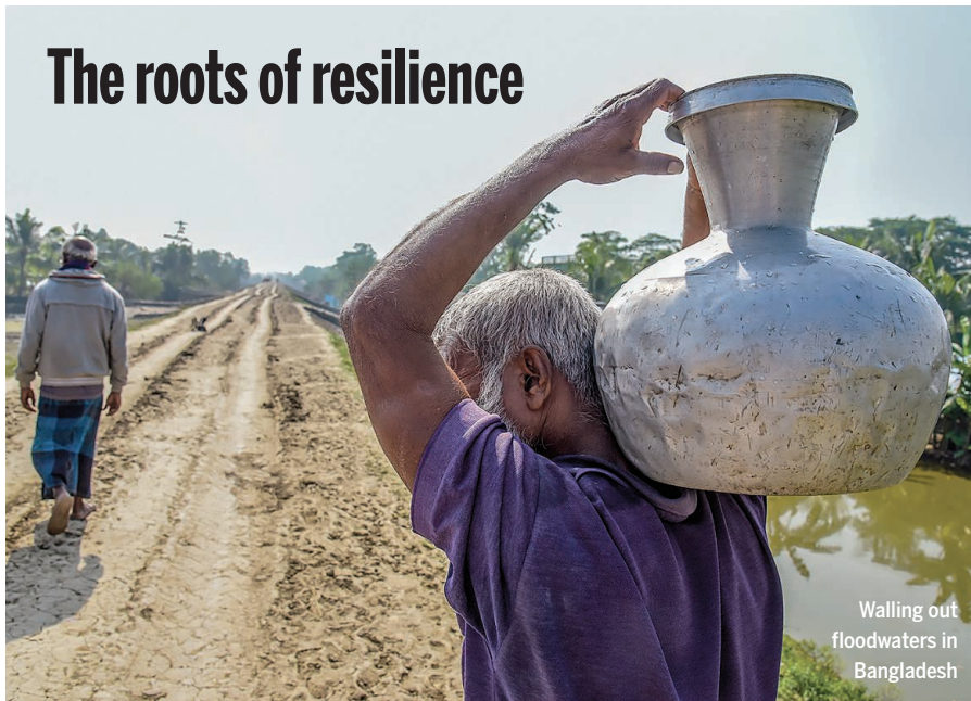
Walling out floodwaters in Bangladesh