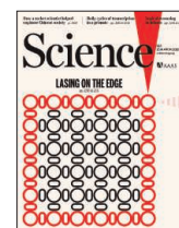
Illustration of a non-magnetic topological insulator laser: an array of microring resonators (circles) coupled by waveguides (ellipses) in a topological fashion. The red perimeter depicts the

lasing topological edge mode, which exits through one of the two outputs (solid red triangle). Implementation of this design in an all-dielectric semiconductor enhances lasing performance and makes many diode lasers operate together as a single highly coherent laser. See pages 1230 and 1231. Illustration: Valerie Altounian/Science