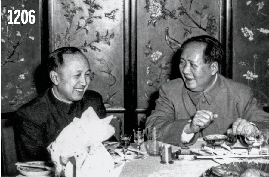
Systems engineer Qian Xuesen had fans in high places.