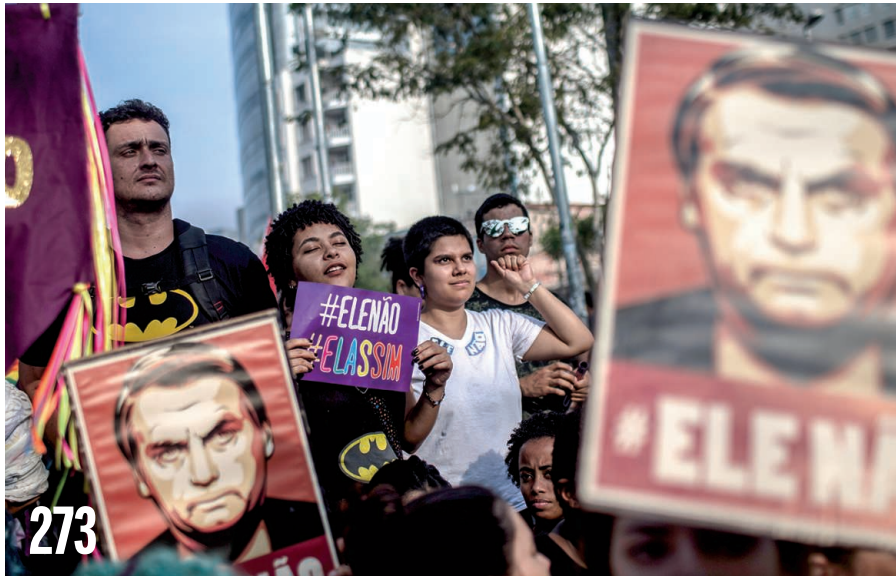
Jair Bolsonaro, front-runner for Brazil's presidency, is a scary prospect to some.