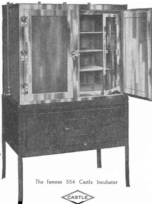
The famous 554 Castle Incubator