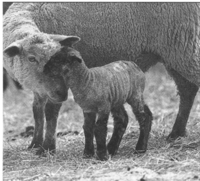
833 How ewes recognize their offspring