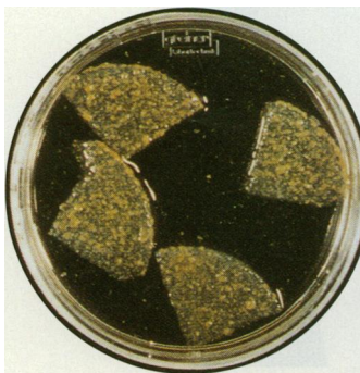
1350 Auxin-independent growth of plant cells