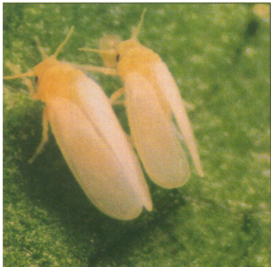
30 & 74 Identification of whitefly species