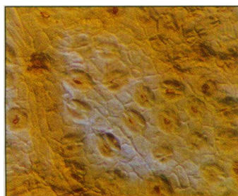
1788 Reading past CO 2 levels in fossil leaves