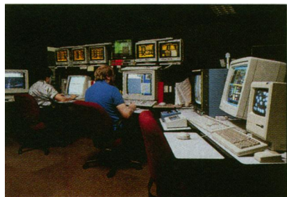
1716 Inside the Space Telescope Science Institute