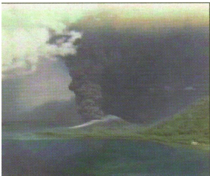
2005 A timely forecast