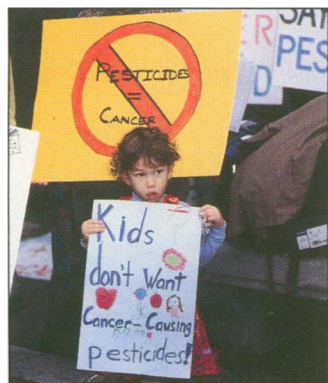
164 Risky science