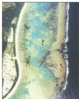
214 Pretty productive