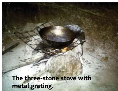
The three-stone stove with metal grating.

Greenhouse gas (GHG) emissions are normally associated with the CO 2 produced by fossil fuel burning in the developed world. However, even the use of solid biomass for heat and cooking in the underdeveloped countries adds to the GHG budget, not in CO 2 but in GHGs such as carbon monoxide and methane that result from incomplete fuel combustion. In order to assess relative GHG potentials of different fuels, Bailis et al. measured actual emissions from a month of measurements of three-stone and ceramic woodstoves and charcoal stoves in an agricultural community in central