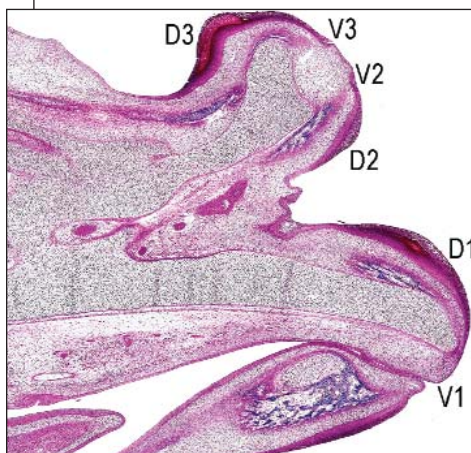
Three beak-like outgrowths (1, 2, and 3) are generated after FEZ grafting.