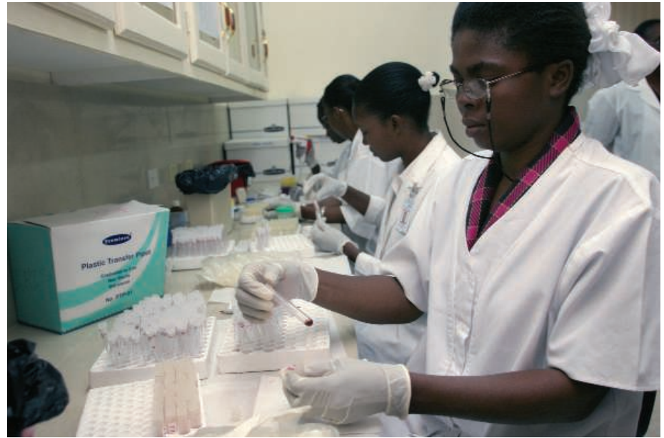
Testing 1, 2, 3. GHESKIO’s well-equipped labs ran 35,000 HIV tests last year, as well as thousands of CD4 counts, TB stains, and rapid tests for syphilis.