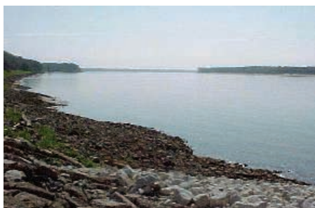
Mississippi River at New Madrid.