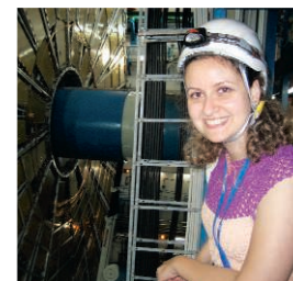
A particle physicist at the Large Hadron Collider.

Study chalks up promiscuous behavior to a single genetic change.