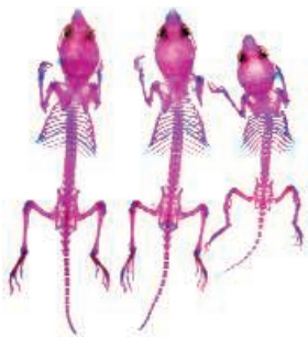
Skeletal development requires the CaSR.