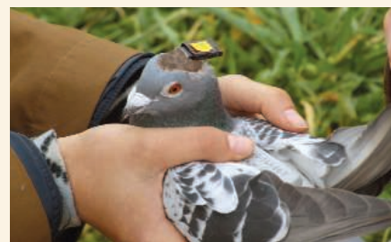
SCIENCENOW Homing phone.

GrantsNet Staff The Funding News, now published weekly, provides the latest index of research funding and student support.