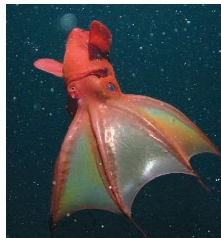
pages 1079 &amp; 1118

A transcription factor required for gene suppression in regulatory T cells is identified.