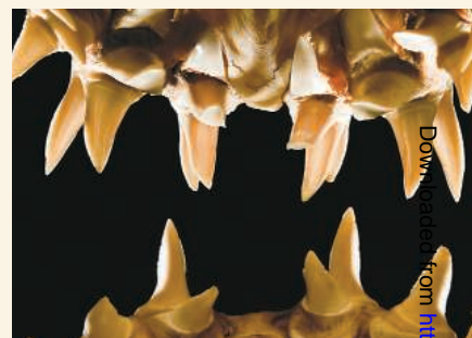
SCIENCESIGNALING Row upon row of shark teeth.