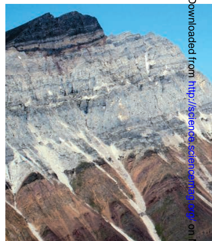
pages 1186 &amp; 1241