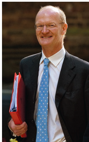
Science’s defender. David Willetts will have to fight off cuts.

The most pressing concern for researchers is how their funding will fare, as the new coalition has made reducing the government deficit its top priority. The coalition has committed to cutting £6 billion from government spending this year, the broad details of which are due to be announced next week. But the specific impact on research spending is more likely to emerge