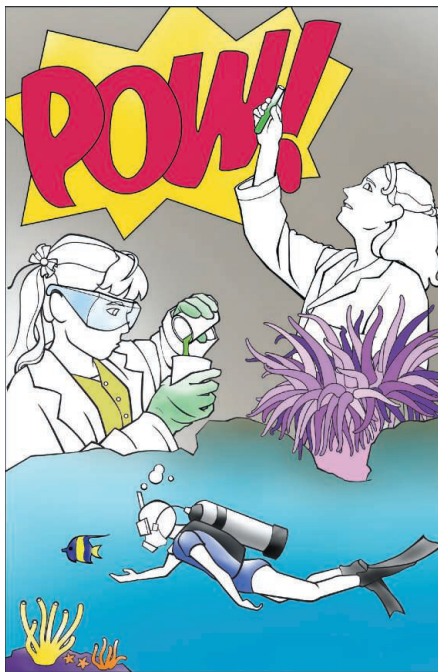
Mysterious World of Dr. Biology.

One such activity is the Virtual Pocket Seed Experiment. This activity provides options for exploring seed germination, energy, gravitropism, and the scientific method both online and as a hands-on experiment. Online there is a pictorial data set involving various seed germination treatments. To help engage students in the activity, time-lapse animations of each seed treatment are included. The compan-