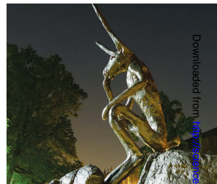
pages 47 & 108