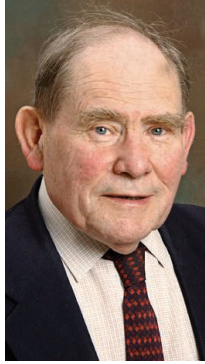
Sydney Brenner is a professor at the Crick Jacobs Center for Theoretical and Computational Biology, Salk Institute for Biological Studies, La Jolla, CA.