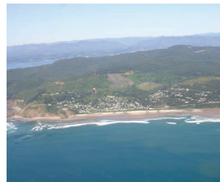
pages 146 & 220