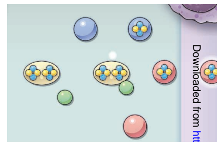
pages 160, 195, &amp; 243