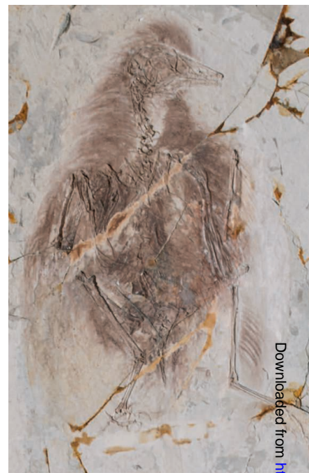
pages 1261 & 1309