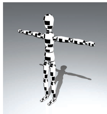
pages 821 &amp; 844