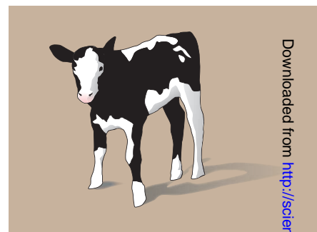
pages 1460 &amp; 1514