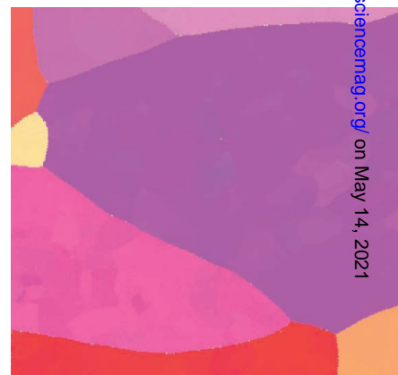
pages 1461 &amp; 1500

SCIENCE (ISSN 0036-8075) is published weekly on Friday, except the last week in December, by the American Association for the Advancement of Science, 1200 New York Avenue, NW, Washington, DC 20005. Periodicals Mail postage (publication No. 484460) paid at Washington, DC, and additional mailing offices. Copyright © 2013 by the American Association for the Advancement of Science. The title SCIENCE is a registered trademark of the AAAS. Domestic individual membership and subscription (51 issues): $149 ($74 allocated to subscription). Domestic institutional subscription (51 issues): $990; Foreign postage extra: Mexico, Caribbean (surface mail) $55; other countries (air assist delivery) $85. First class, airmail, student, and emeritus rates on request. Canadian rates with GST available upon request, GST #1254 88122. Publications Mail Agreement Number 1069624. Printed in the U.S.A.