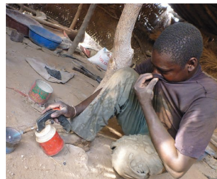
pages 1430, 1442, & 1457

>> For full text: www.sciencemag.org/extra/curiosity