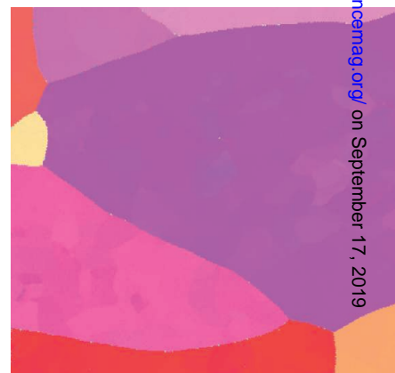
pages 1461 &amp; 1500

SCIENCE (ISSN 0036-8075) is published weekly on Friday, except the last week in December, by the American Association for the Advancement of Science, 1200 New York Avenue, NW, Washington, DC 20005. Periodicals Mail postage (publication No. 484460) paid at Washington, DC, and additional mailing offices. Copyright © 2013 by the American Association for the Advancement of Science. The title SCIENCE is a registered trademark of the AAAS. Domestic individual membership and subscription (51 issues): $149 ($74 allocated to subscription). Domestic institutional subscription (51 issues): $990; Foreign postage extra: Mexico, Caribbean (surface mail) $55; other countries (air assist delivery) $85. First class, airmail, student, and emeritus rates on request. Canadian rates with GST available upon request, GST #1254 88122. Publications Mail Agreement Number 1069624. Printed in the U.S.A.