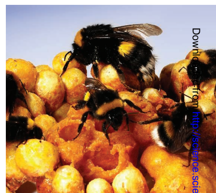
pages 254 & 287

Downloaded from http://science.sciencemag.org/ on May 7, 2021