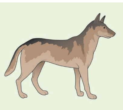
pages 376 & 437