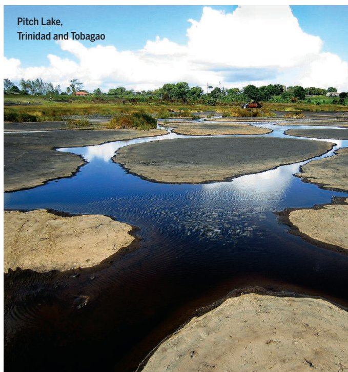
Pitch Lake, Trinidad and Tobago