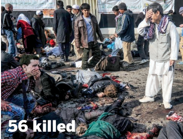
December 2011 Suicide bombing in Kabul

November 2011 Mullah Mohammed Omar calls on Taliban to "take every step to protect the lives" of civilians