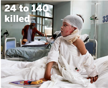
May 2009 ISAF airstrike in Granai