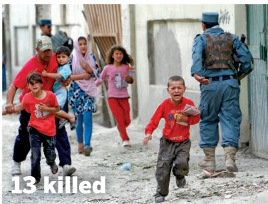
May 2013 Double IED attacks in Kabul

Caused by insurgents Deaths (Red) Injuries (Light Red) Caused by ISAF Deaths (Dark Blue) Injuries (Light Blue)