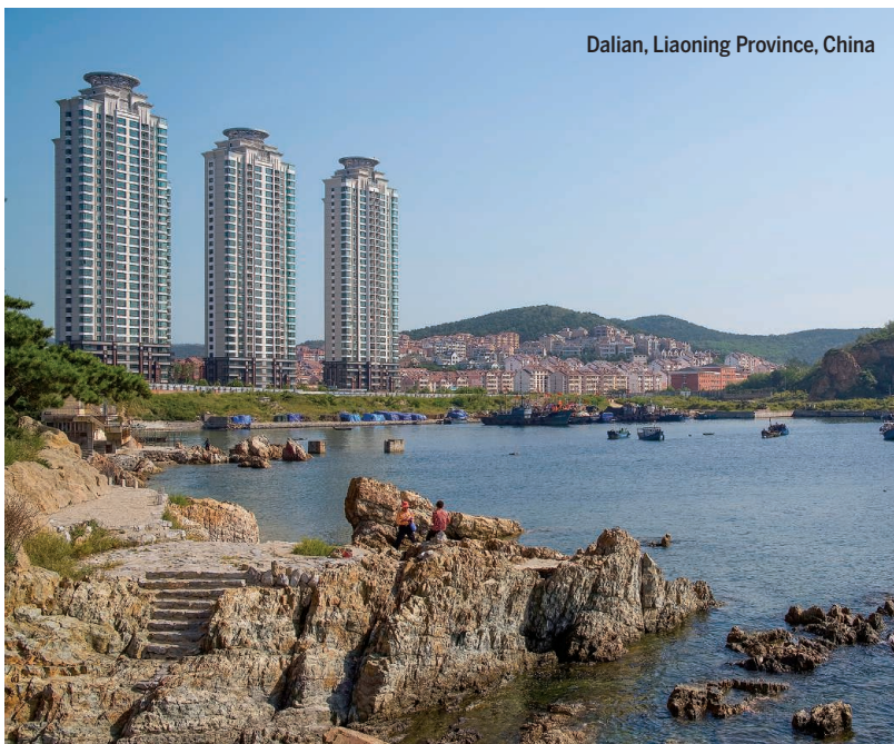
Dalian, Liaoning Province, China