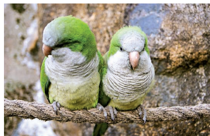
Monk parakeets' relationships are key to their smarts.