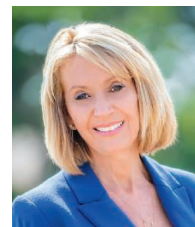
Marcia McNutt Editor-in-Chief Science Journals