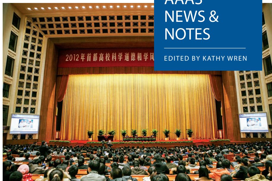
Graduate students attend a public lecture on research ethics at the Great Hall of the People, in Beijing.