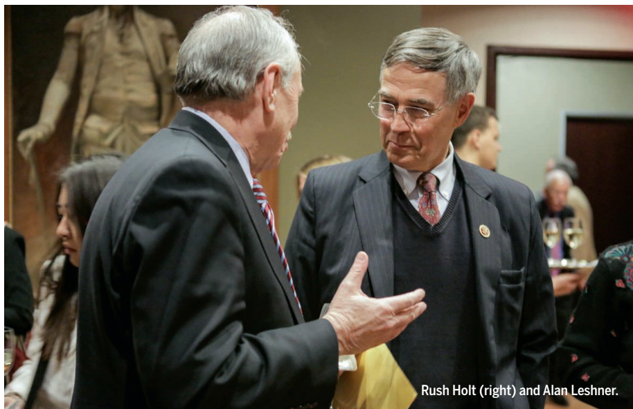
Rush Holt (right) and Alan Leshner.

"AAAS, as one of the world's most respected nonprofit, nonpartisan organizations and publisher of the leading Science family of journals, helps to promote scientific progress and to improve human welfare," Holt said regarding his acceptance of the leadership role at AAAS. "I look forward to supporting the Association's mission to advance science, engineering, and innovation throughout the world, for the benefit of all people." ■