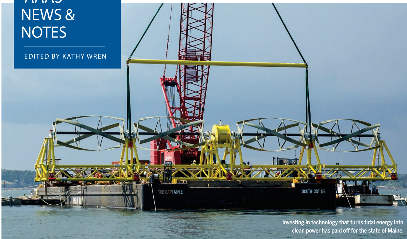
Investing in technology that turns tidal energy into clean power has paid off for the state of Maine.