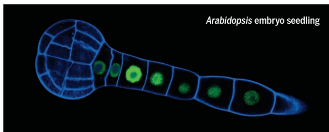
Arabidopsis embryo seedling