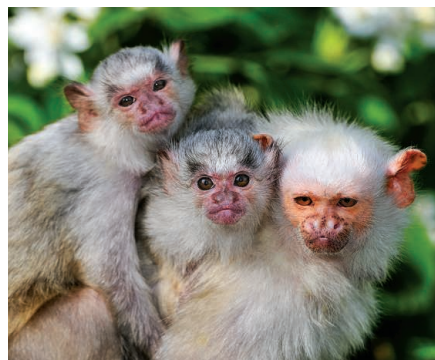
South American silvery marmosets ( Mico argentatus ) had an African ancestor.

skeletal resemblances to ancient African monkeys. Now, Bond et al. describe three 36 million-year-old fossil teeth found in the Peruvian Amazon that support this idea: The shape of the teeth and phylogenetic analyses link