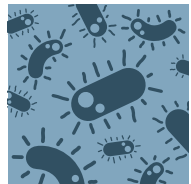
INFECTIOUS DISEASE SERIES

About 1.2 billion people worldwide are estimated to suffer from a fungal disease (1, 2). Most are infections of the skin or mucosa, which respond readily to therapy, but a substantial minority is invasive or chronic and difficult to diagnose and treat. An estimated 1.5 to 2 million people die of a fungal infection each year, surpassing those killed by either malaria or tuberculosis (3). Most of this mortality is caused by species belonging to four genera of fungi: Aspergillus , Candida , Cryptococcus , and Pneumocystis . Although great strides were made in the 1990s, drug development has largely stalled since then.