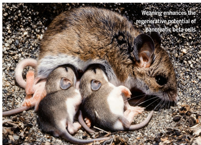
Weaning enhances the regenerative potential of pancreatic beta cells