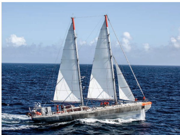
Research schooner Tara supported a multinational, multidisciplinary team in sampling plankton ecosystems around the world.